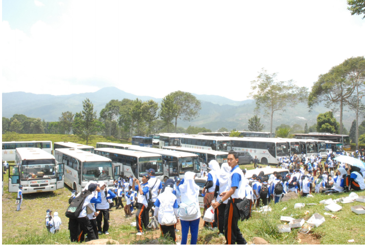
Buses as means of transportation to Gunung Mas Tea Plantation.