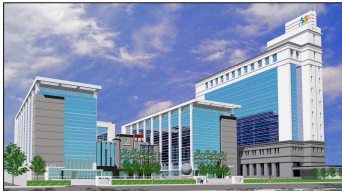
Buildings Complex of BPS-Statistics Indonesia

BPS-Statistics Indonesia is a very large and important institution with around fifteen thousand employees spread all over Indonesia. In BPS headquarters, there are about two thousand employees.