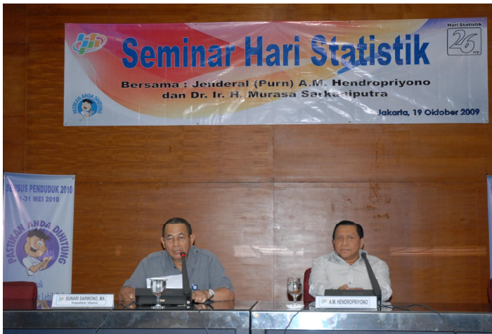
Statistics Day Seminar was conducted to develop greater understanding of the role of official statistics to support the government activities and policies.