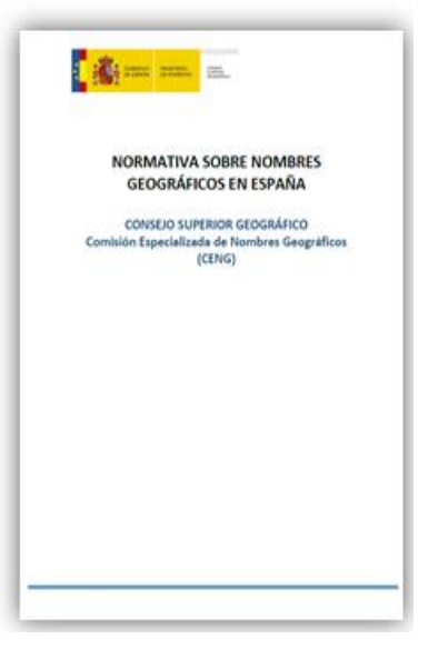
Figure 2: Summary of Spanish legal frame in geographical names

Due to the diversity of Spanish legal frame in geographical names, the Specialized Committee for Geographical Names (Comisión Especializada de Nombres Geográficos, а multidisciplinary committee that includes State and regional Administrations, plus other organizations with competence in geographical names, such as Universities and Academies of Language) has published а summary of the Spanish legal frame that can be consulted at FOMENTO website (fig. 2).