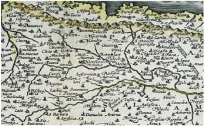
Figure 3: Toponyms of Cyprus – Part of Map of Cyprus (Mercator Hondius), 1633

Cyprus is privileged to have most of its geographical names bequeathed in ancient texts from Homer to Herodotus, the tragic poets and Strabon, up to ancient cartographers, like Claudius Ptolemaeus, and from medieval cartographers, like Abraham Ortelius, up to lord Horatio H. Kitchener, who mapped Cyprus in the 19th Century, at the beginning of the British rule of the island.