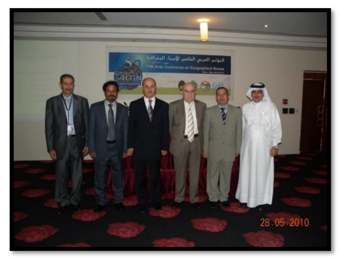
Fifth Arab conference on geographical names Beirut, Lebanon 2010

first in the Arab division of geographical names meeting in Beirut, and since, we met and visited and worked together in many occasions, not only in the geographical names field, but also in many other