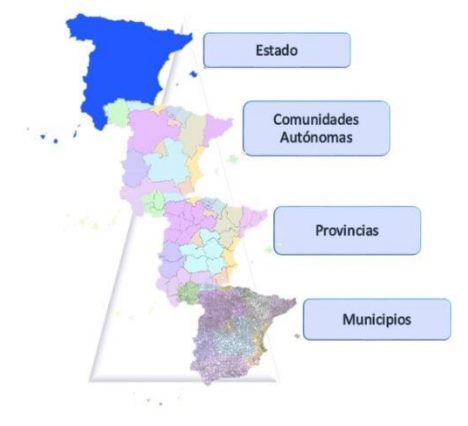
Figure 1: Levels of Territorial division in Spain

Thus, there are three levels of competence corresponding to the State, the Autonomous Communities and the Local Administration (municipalities and others) (fig. 1). Every Administration has the right to create its own competent organizations in geographical names: At a State level we can consider several of them: the Local Entities