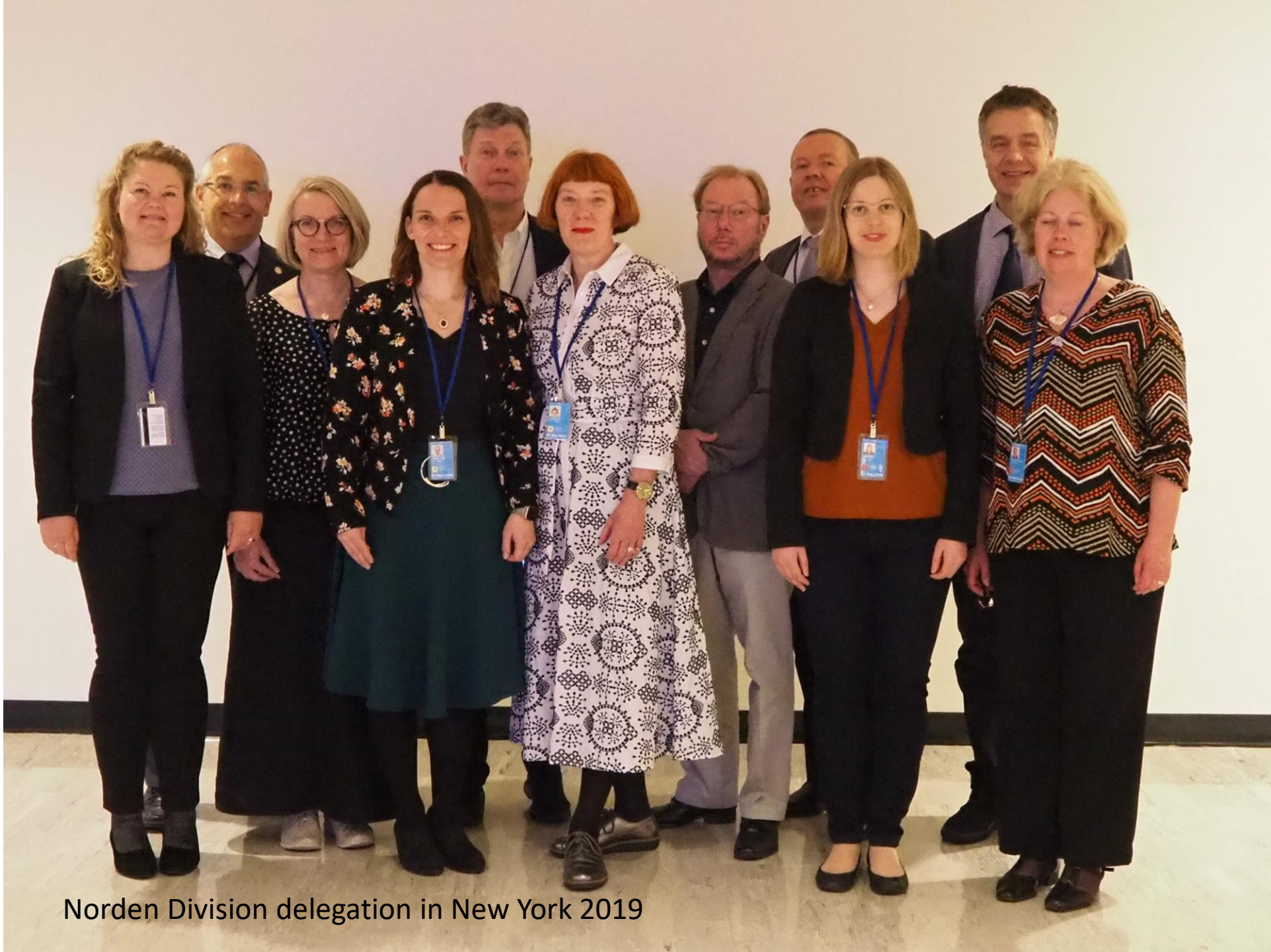
Norden Division delegation in New York 2019