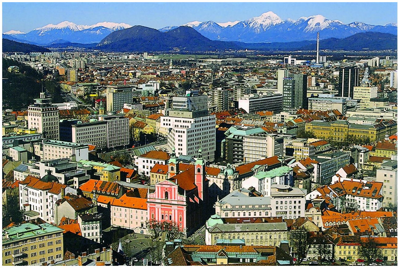
Ljubljana

23<sup>rd</sup> meeting of the Working Group on Exonyms / Terminology Working Group Ljubljana 31 Aug.-3 Sep. 2022 – Programme