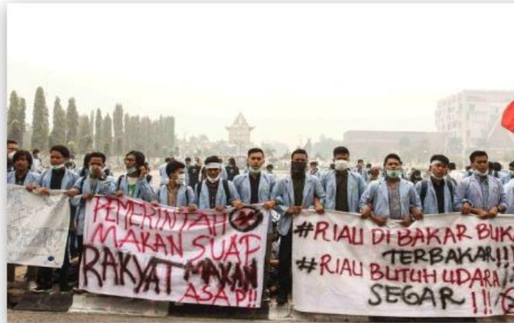
Sejumlah mahasiswa FISIP Universitas Riau menggelar aksi unjuk rasa terkait penanganan kebakaran lahan yang menyebabkan kabut asap di kantor Gubernur Riau di Pekanbaru, Riau, Kamis (12/9/2019). Oleh: Aditya Widya Putri - 21 September 2019