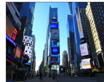
Times Square, 2012