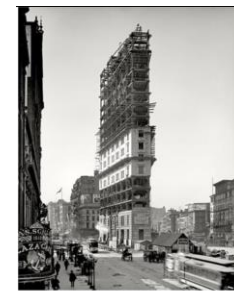
Times Square, 1903

The Modern Family: Changes in Structure and Living Arrangements in the United States: Students will learn why families are important social institutions and how family structures, household sizes, and living arrangements have changed substantially since the 1970s.