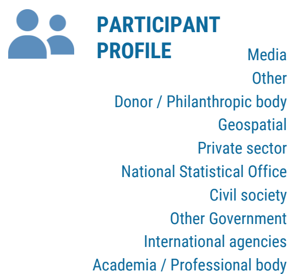
Participants by organization type (%)