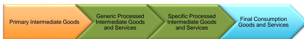
Figure 3. BEC Rev.5, Value Added Chain

25. Figure 3 shows how a general categorization of value added can be extracted from the structure of BEC Rev. 5. This model begins with primary intermediates in the processing dimension, followed by the increasing end product specificity in the specification dimension (generic and then specific processed intermediates), and ends with final consumption goods and services, as depicted in Figure 3.