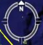
Image NASA © 2008:Europa Technologies © 2008 Tele Atlas Image © 2008 TerraMetrics