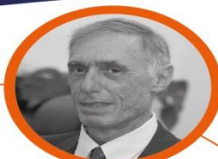
Giorgio Alleva President of Istat, Italian National Institute of Statistics