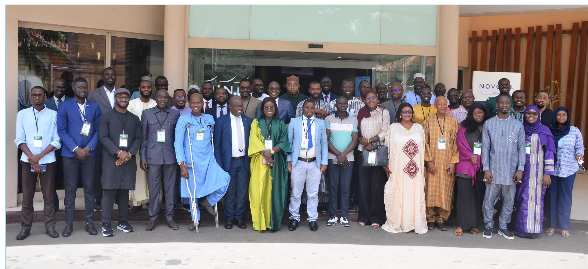
Senegal, Regional CCDE Workshop 2024