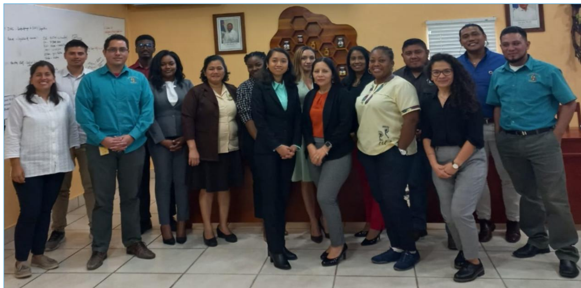
Belize, Environment statistics sectoral meeting 2023