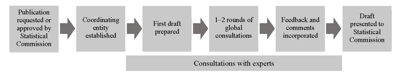
Figure I Common road map to adoption (non-revision)