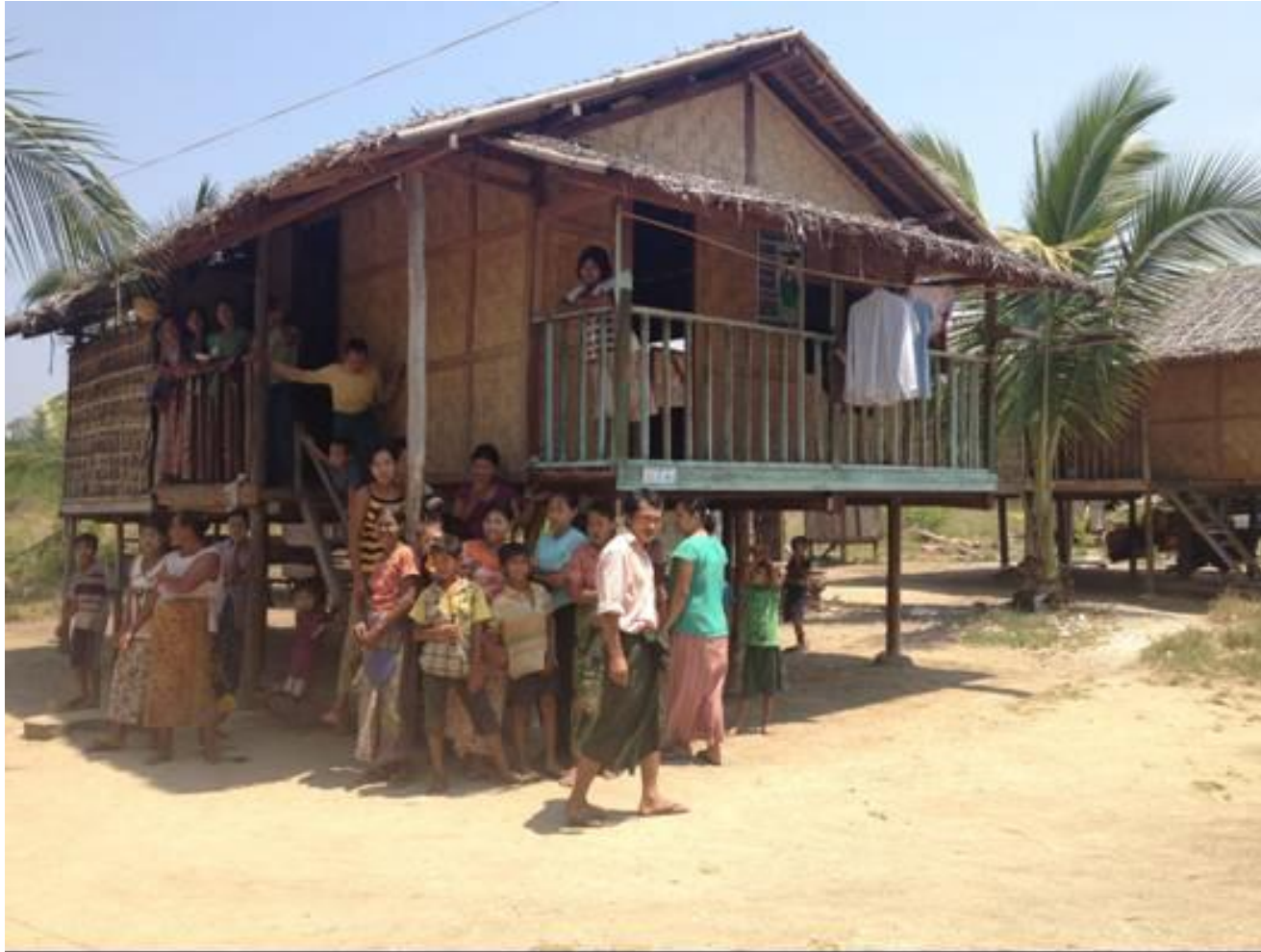
Profiling scoping mission in South-East Myanmar 2013: Identifying IDP communities