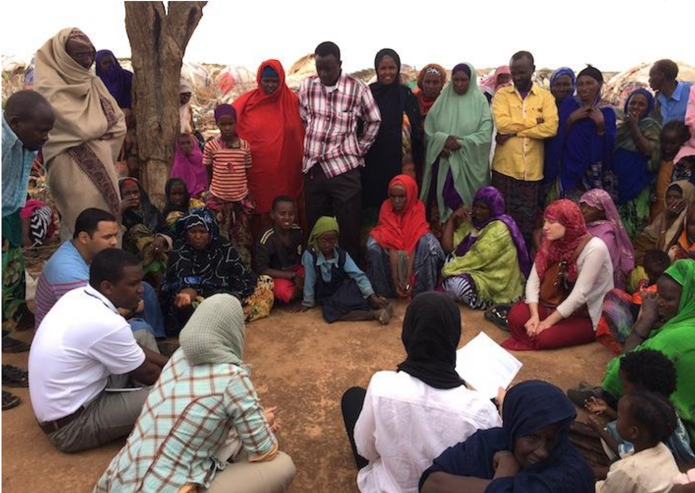
Urban Profiling in Hargeisa, Somaliland, 2014 Community discussion to inform profiling process