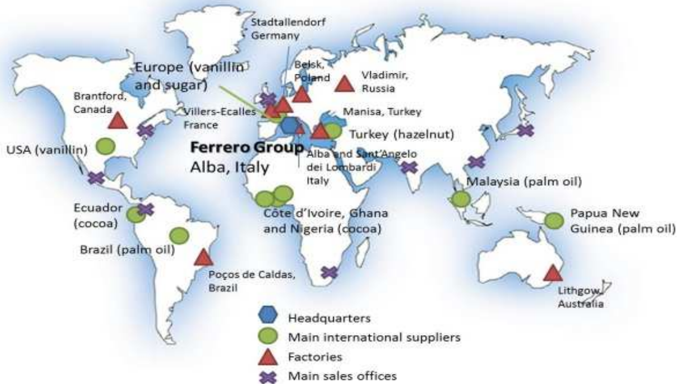
Figure 6. The Nutella® global value chain