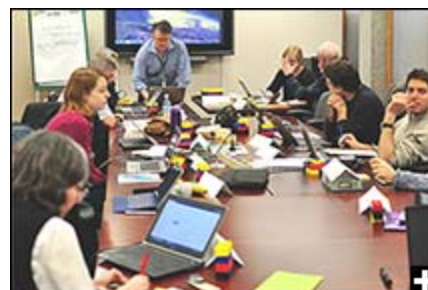
Statistics Canada hosted an HLG-MOS 'sprint' in February 2015.