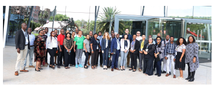
Country visit to South Africa Pretoria, 6-8 December 2022