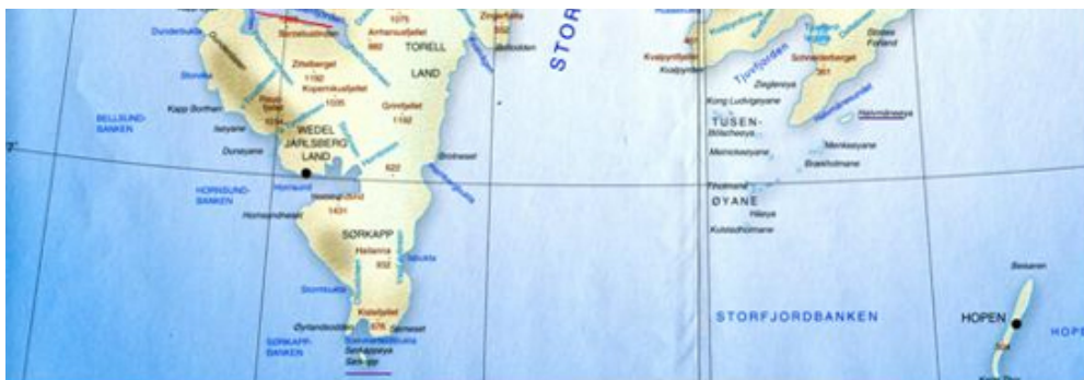
Svalbard, map by Trond Haugskott in the book Stedsnavn på Svalbard, by Eli Johanne Ellingsve, Trondheim, Tapir Akademisk Forlag 2005. Names underlined in red have a Dutch specific name part; names underlined in purple have been translated from Dutch into Norwegian.

What is wholly reprehensible is the obliteration of existing place names and their replacement by placenames that suit those in charge. It is the toponymical counterpart of ethnic cleansing, and it happened under nationalist ideologies in both Europe and elsewhere. The United Nations have taken a strong stand against this particular aspect of names planning, in resolution III-16 and VI-9 (see UNGEGN webpage " Resolution on the Standardization of Geographical Names ", click here for pdf , resp. pp. 32 and 34 and/or see images below).