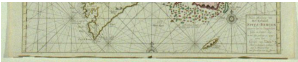
Dutch names on a 18th century map of Svalbard (Gerard van Keulen, Nieuwe afteekening van het eyland Spitsbergen, ca 1710)