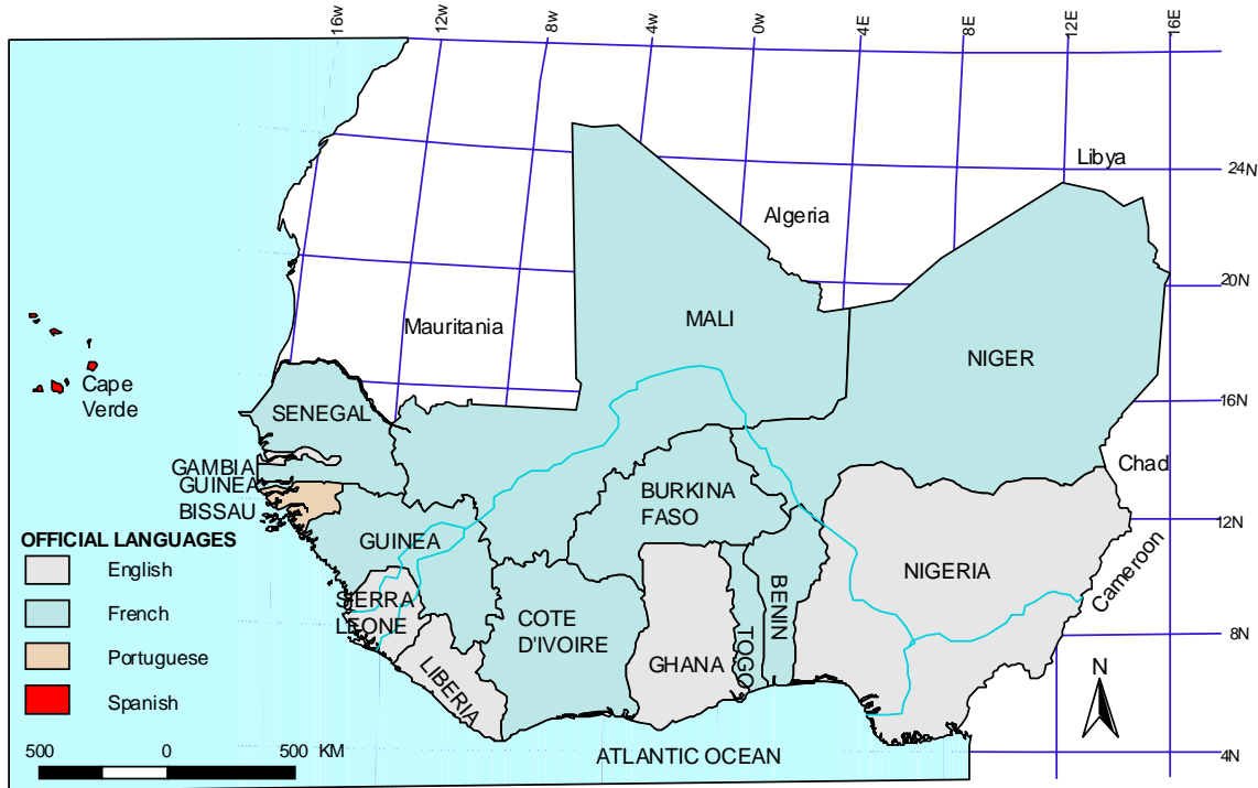
Figure 1: Official languages spoken in West African countries