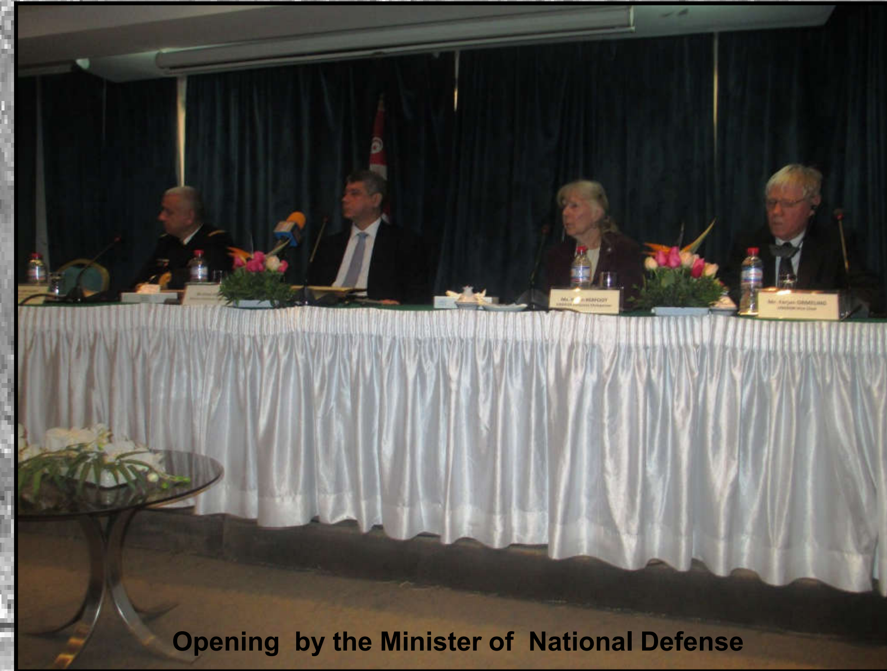
Opening by the Minister of National Defense