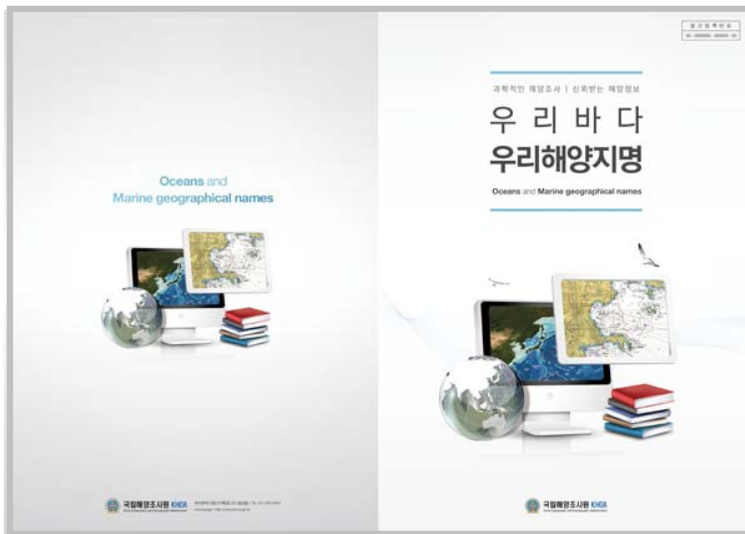
Figure 1. Cover Page of Collection of Marine Geographical Names

The first part of this book explains about the importance of marine geographical names, the procedures related to the standardization of marine geographical names, definitions of various generic terms, registration and notification. It then provides an index map by region and lists both the marine surface names and undersea feature names by region. This book has been designed to help the readers better understand the marine geographical names (Figure 1-3).