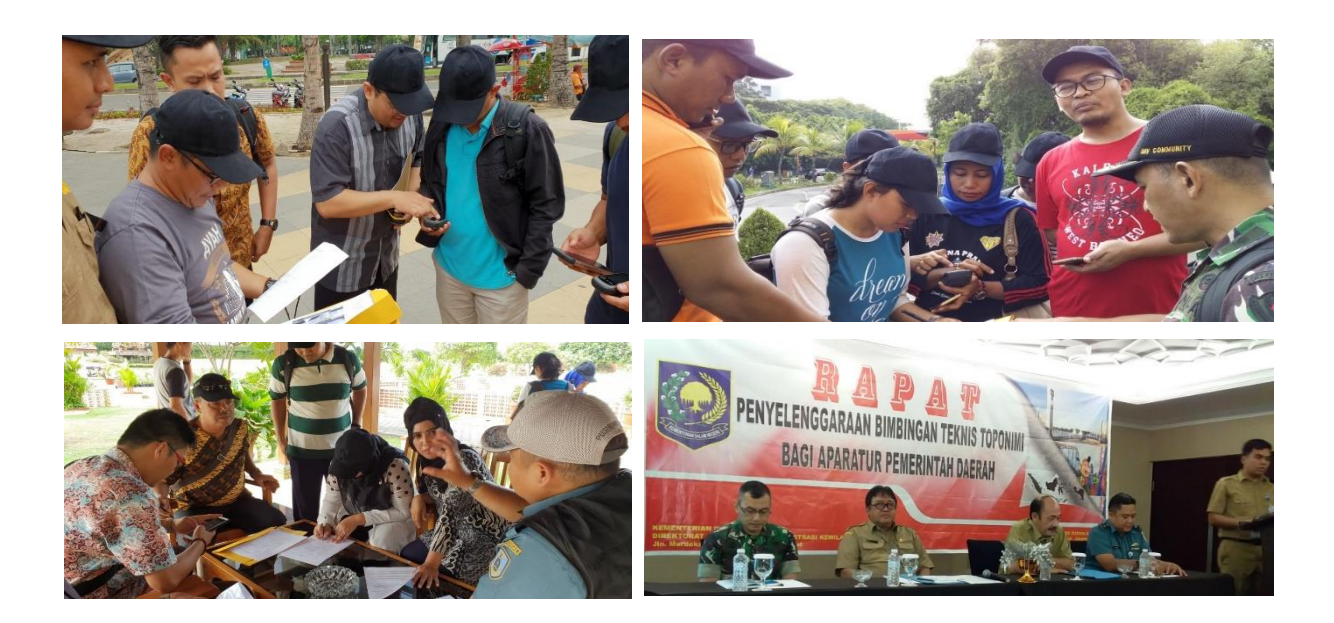
Figure 2 Toponym activities of the Ministry of Home Affairs shows verification and standardization of geographical names and Toponym Technical Guidance meeting

Toponym technical guidance had also been carried out for local government officials from several provinces during the period of September – October 2018.