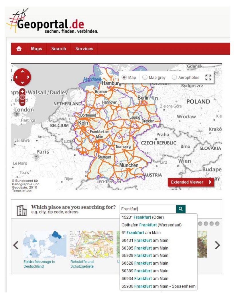
Figure 3 - The German national geographical names database (GN-DE) published as a web service which is part of the national spatial data infrastructure (GDI-DE) and visualised through the Geoportal application (Geoportal.de)

This search utility has been developed at the BKG Central Service and Distribution Center for Geoinformation and is widely used in the portal application. It builds upon the 'Georeferenced Address Data Federation' data set and parts of the very comprehensive names dataset 'Geographical Names of Germany' (GN-DE) derived as dataset 'GN250', Geographical Names of Germany (1:250.000) [3]. As mentioned before, GN-DE provides the unique source for all BKG products and naturally for the national (gazetteer) web feature service, too. GN-DE also provides geographical names in the officially recognized Sorbian and Frisian minority languages. The integration of those minority language names in the search utility for places and addresses of the Geoportal.de is envisaged, but not realized as yet (2019).