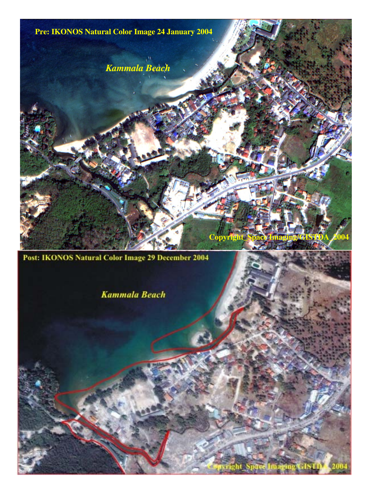
Figure 3 Pre and post natural color composite IKONOS images of Kammala beach, Phuket province taken on January 24, 2004 and December 29, 2004 showing before and after shoreline and river bank erosion in red and yellow respectively.