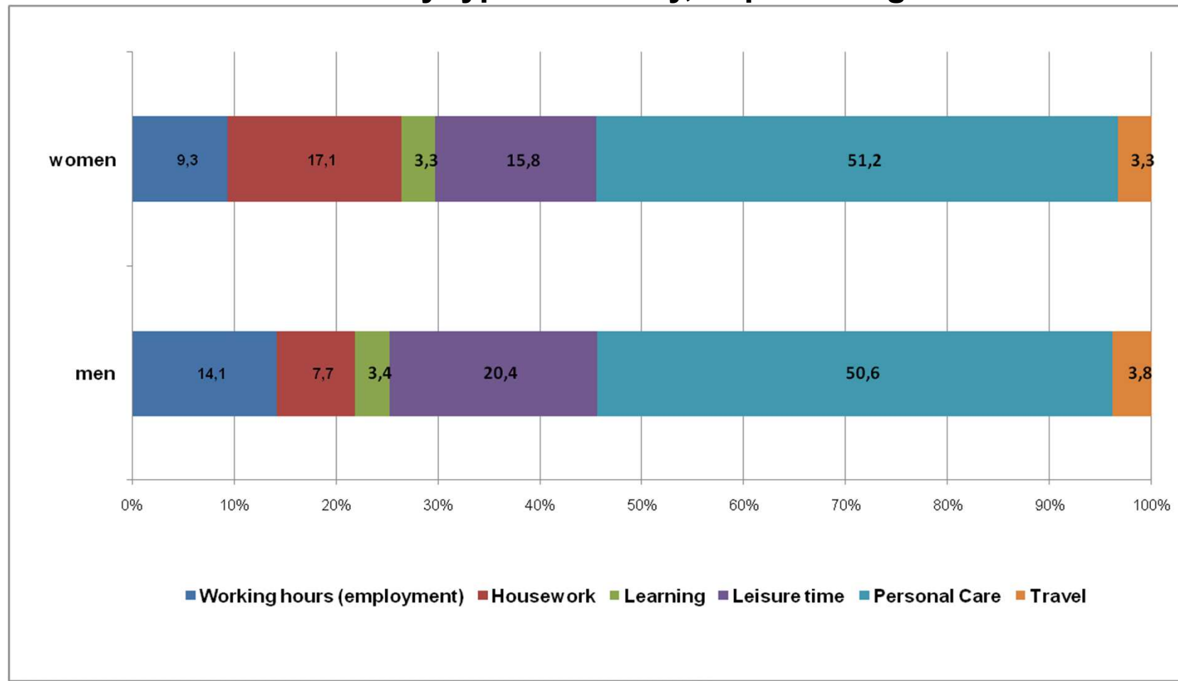
Distribution of the time budget of men and women aged 10 years and older by type of activity, in percentage