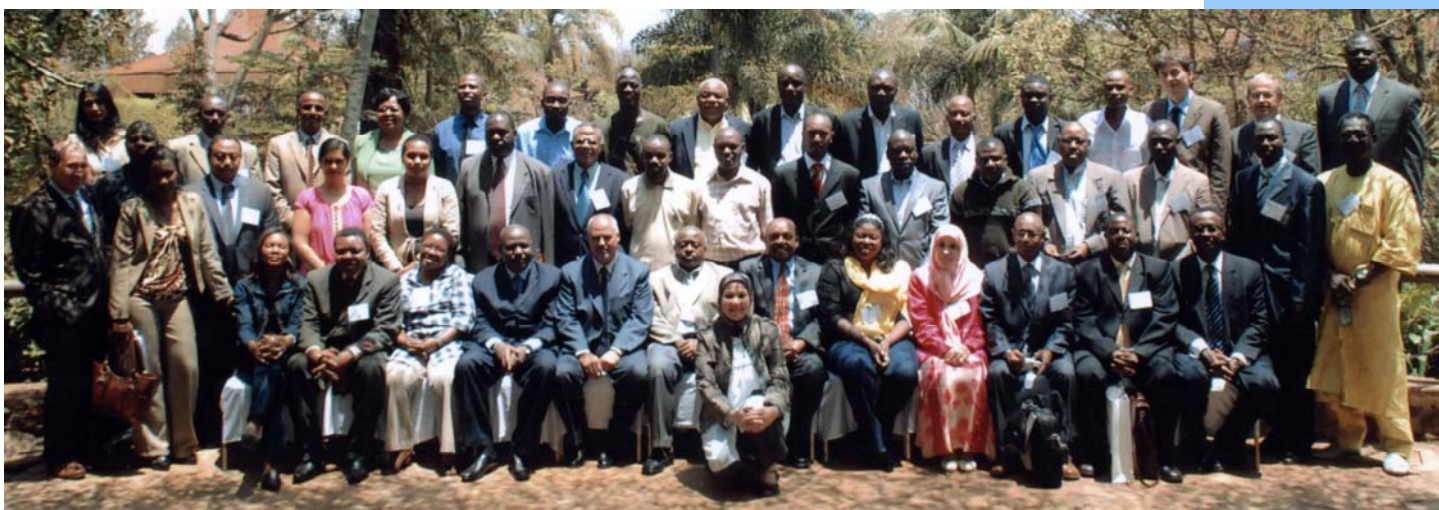
Nairobi regional seminar on census data dissemination, 14-17 September 2010

evaluating censuses with a focus on the post enumeration survey (PES) methodology. The workshops also offered an opportunity for the participants to present and discuss the experience of their countries on different aspects of census evaluation and the PES. The workshop for the Asian region was organized in Bangkok, Thailand from 10 to 14 May 2010, while the workshop for Arabic speaking countries took place in Amman, Jordan from 21 to 24 November 2010. The workshops were attended by a total of 53 participants from 33 countries.