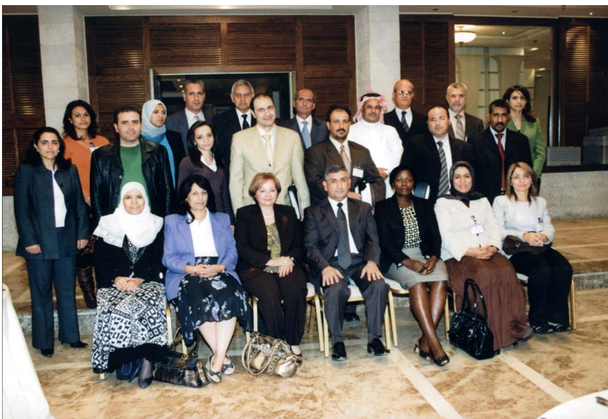
Amman workshop on census evaluation, 21-24 November 2010

For more information including event programmes and presentations see: http://unstats.un.org/unsd/demographic/meetings/wshops/default.htm