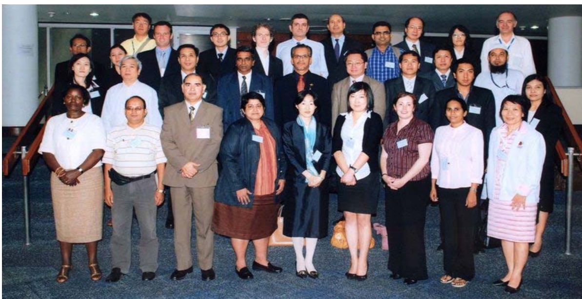
Bangkok regional seminar on census data dissemination, 5-8 October 2010

UNSD has organized two regional seminars on strategies and technologies for census data dissemination. The seminars were attended by 71 participants from 49 countries. The seminars were organized with the aim to provide a forum for sharing national practices and experiences in the dissemination and use of census data. The seminars reviewed emerging trends, innovative approaches and technological tools employed in the dissemination of census data. The