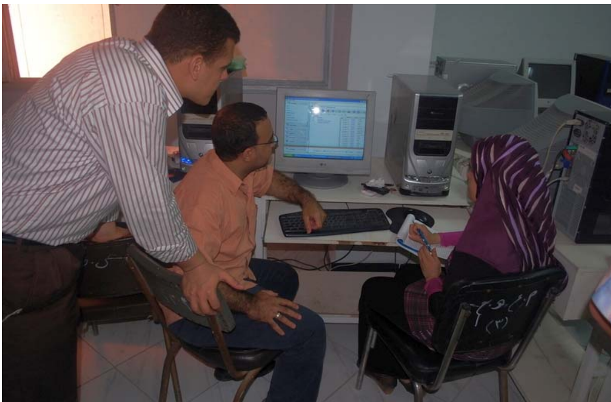
CensusInfo training, Egypt

For more information on upcoming UNSD events, see http://unstats.un.org/unsd/census2010.htm