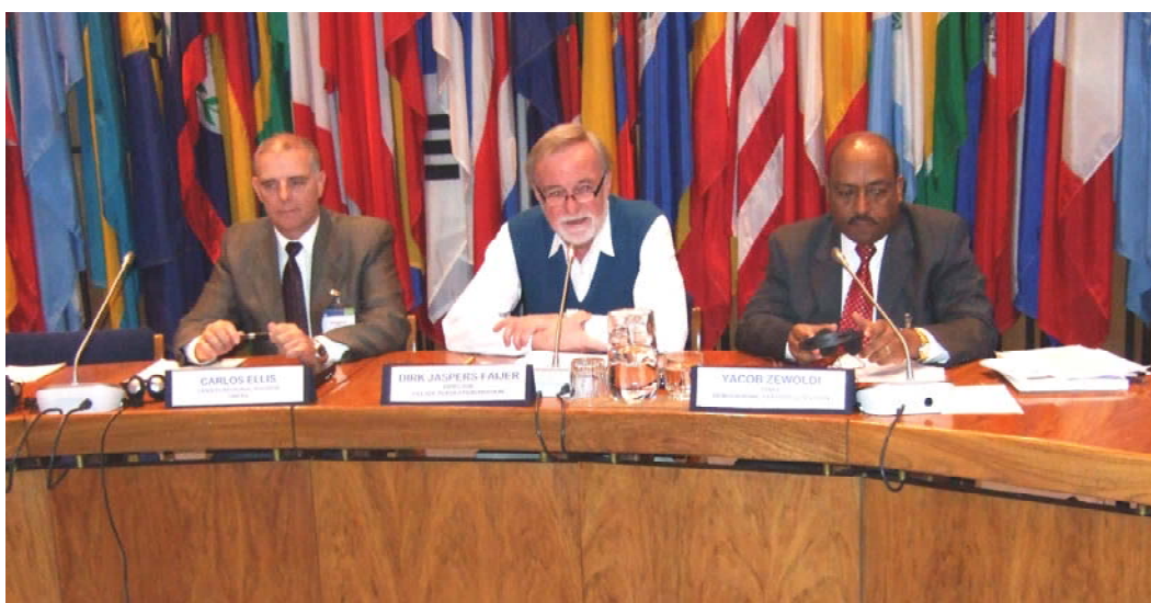
Regional seminar on census data dissemination and spatial analysis, Santiago, Chile 31 May - June 2011

More information on the regional seminars is available at: http://unstats.un.org/unsd/demographic/sources/cwp2010/docs.htm