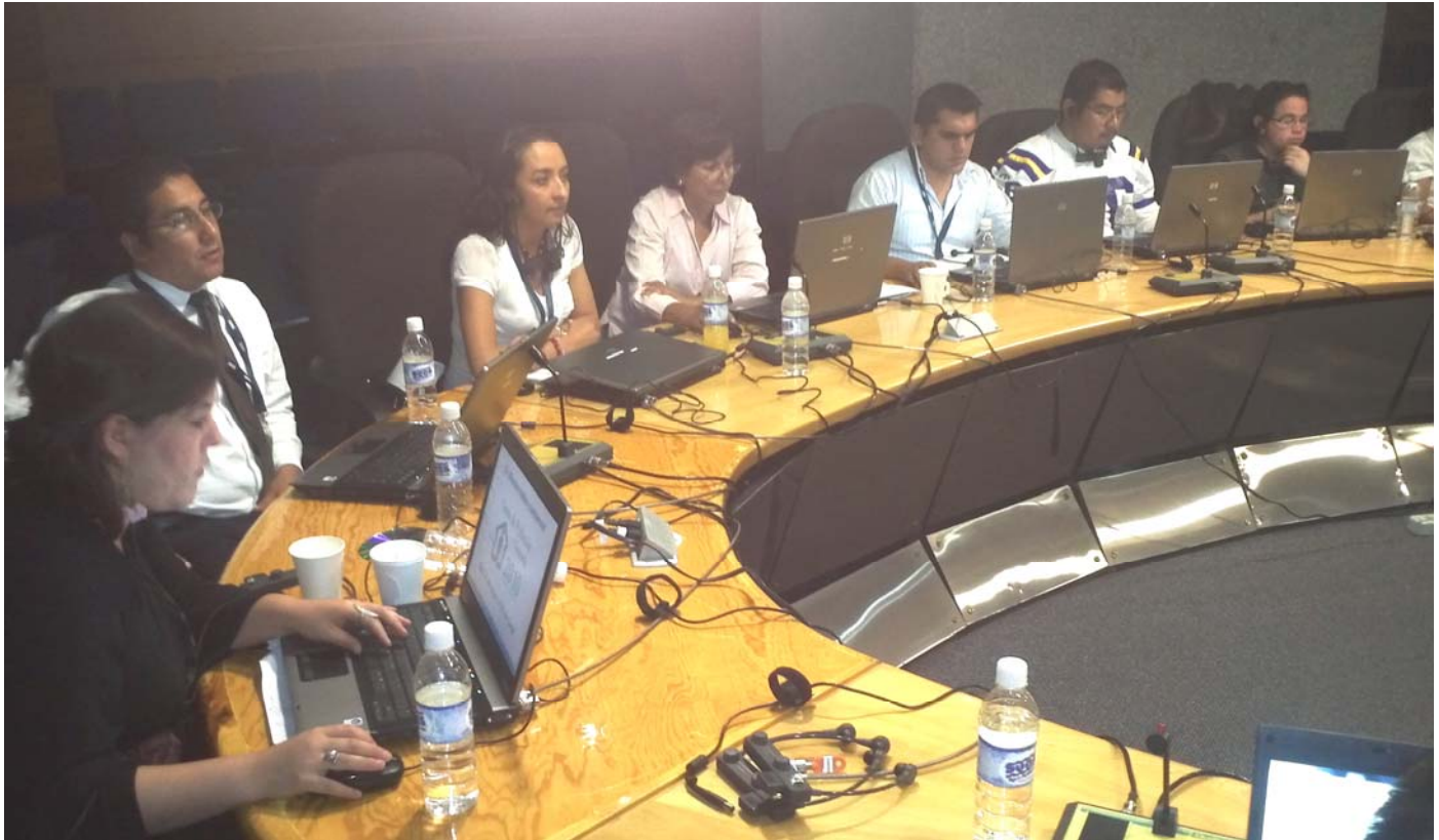
National training workshop on CensusInfo, Aguascalientes, Mexico, 18-22 July 2011

The national training workshop on CensusInfo was held for the staff of Instituto Nacional de Estadística y Geografía (INEGI) in Aguascalientes, Mexico from 18 to 22 July 2011. The workshop was intended to develop the capacity of INEGI to adapt CensusInfo to its full potential as a platform for disseminating census data. The workshop was attended by twenty staff members of the Technical Division of INEGI with responsibility in different areas of the census operation.