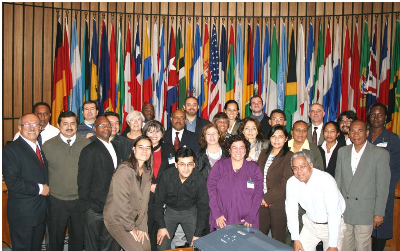
Regional seminar on census data dissemination and spatial analysis, Santiago, Chile, 31 May - June 2011