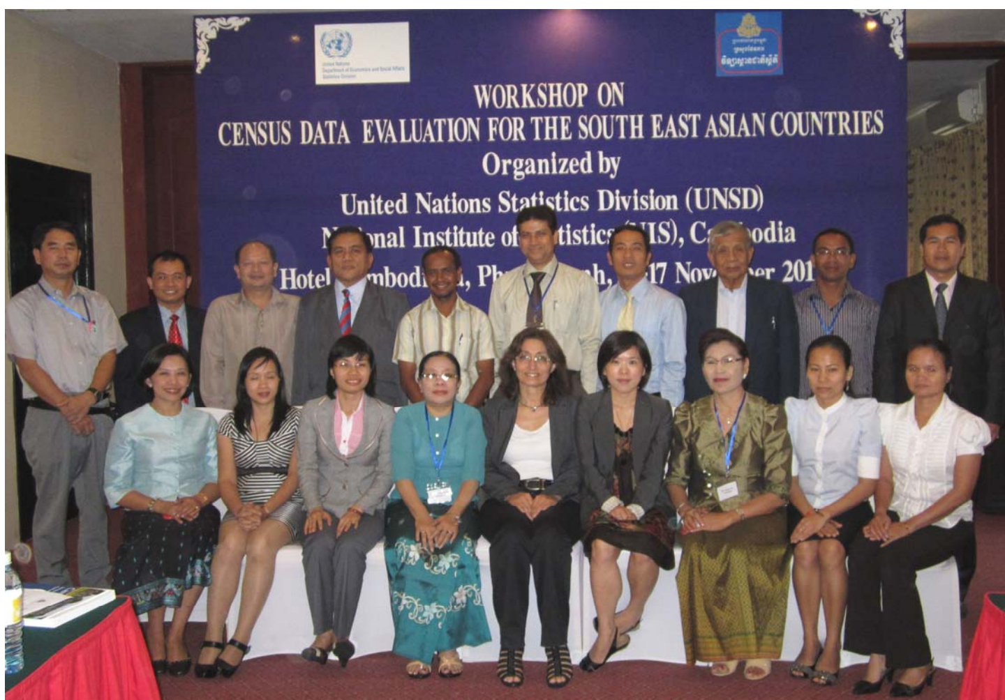
Sub-regional Workshop on Evaluation of Census Data, Phnom Penh, Cambodia, 14-17 November 2011