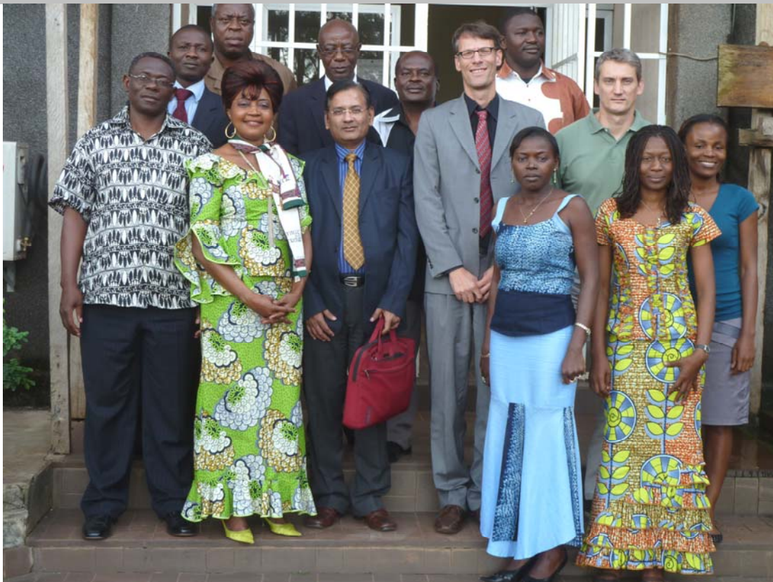
National Workshop on CensusInfo, Yaoundé, Cameroon, 3-7 October 2011

CensusInfo is a software package developed by the United Nations Statistics Division in partnership with UNICEF and UNFPA to help countries disseminate their census data on CD-ROM and on the web. It was officially launched at the United Nations Statistical Commission on 23 February 2009 and is distributed royalty-free. More information on CensusInfo is available at the website dedicated to its promotion: http://www.censusinfo.net