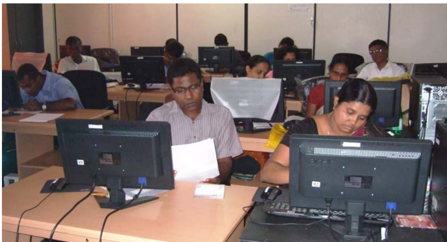
National Workshop on CensusInfo, Colombo, Sri Lanka, 19-23 September 2011