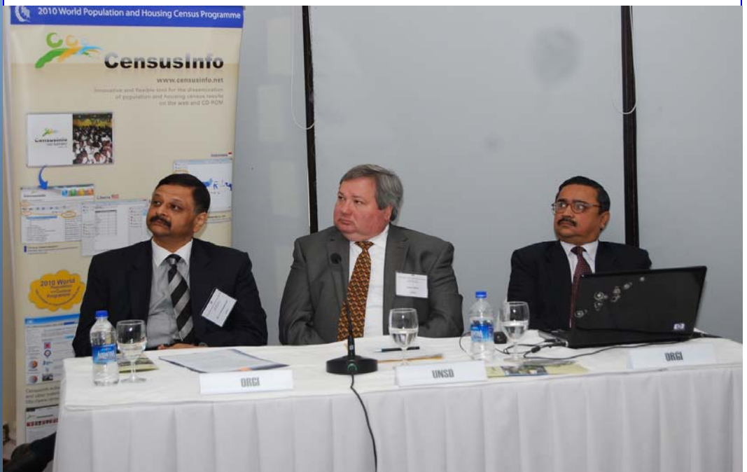
United Nations Regional Workshop on CensusInfo, New Delhi, 28-30 November 2011

The main objective of the workshops was to develop the capacity of the staff of the national statistics offices to adapt CensusInfo with a view to using it as a platform for disseminating census data. The workshops provided conceptual and technical knowledge to implement the CensusInfo application for disseminating census results. Participants at the national workshops learned the various processes involved in the adaptation of CensusInfo. The sessions included hands-on training on using the CensusInfo User Interface and Database Administration applications as well as an introduction to the process of web-enabling the CensusInfo database. Topics of the Administrator application covered during the workshop included the following areas: steps for creating a CensusInfo template and