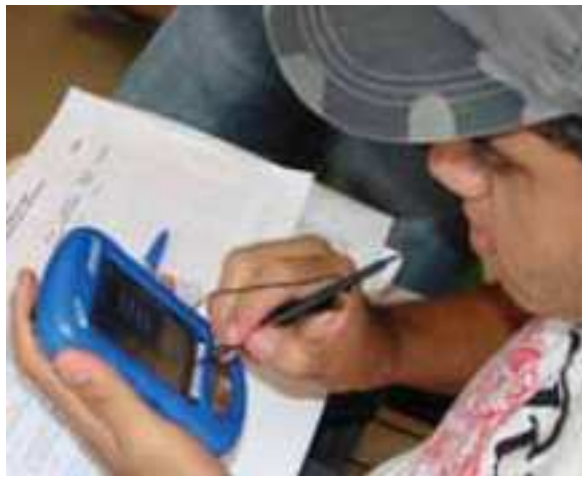
Training underway with PDA

Training of the large number of enumerators was undertaken using a combination of materials including, Videos, Intranet/Internet, Manuals and other printed materials. A 'chain' training method was used to train all staff involved in the process. 41 specialists trained 332 trainers, who in turn then trained 1,549 instructors who then trained 18,000 supervisors who then finally trained 68,000 enumerators. The training and distance learning materials along with the PDA were all used to support the chain training method to ensure continuity throughout the process.