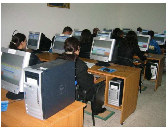
Key correction and coding area

5. Key correction and coding – As indicated only those responses that fell below the ICR engines confidence levels were key corrected by operators.