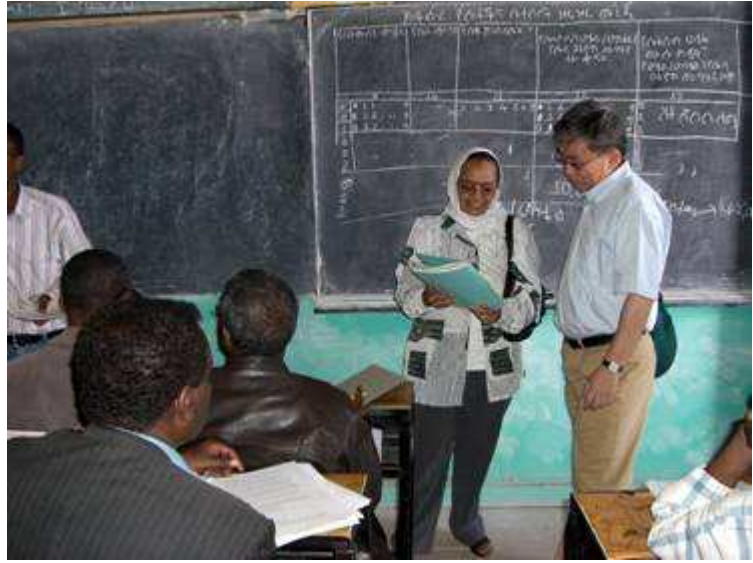
Enumerator training in Ethiopia

The CSA recruited all the necessary temporary staff for the processing centre and made sure they had the appropriate training on both the scanning system and CSPro.