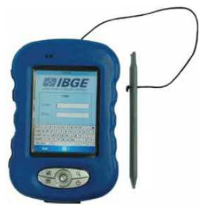
PDA used in Brazilian census project 2007

When the publicity campaign began for the census project, it was observed that the PDA had a very strong visual appeal; it soon became a symbol to identify the IBGE enumerators.