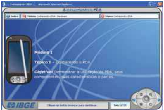
Distance learning software

Training of the large number of enumerators was undertaken using a combination of materials including, Videos, Intranet/Internet, Manuals and other printed materials. A 'chain' training method was used to train all staff involved in the process. 41 specialists trained 332 trainers, who in turn then trained 1,549 instructors who then trained 18,000 supervisors who then finally trained 68,000 enumerators. The training and distance learning materials along with the PDA were all used to support the chain training method to ensure continuity throughout the process.