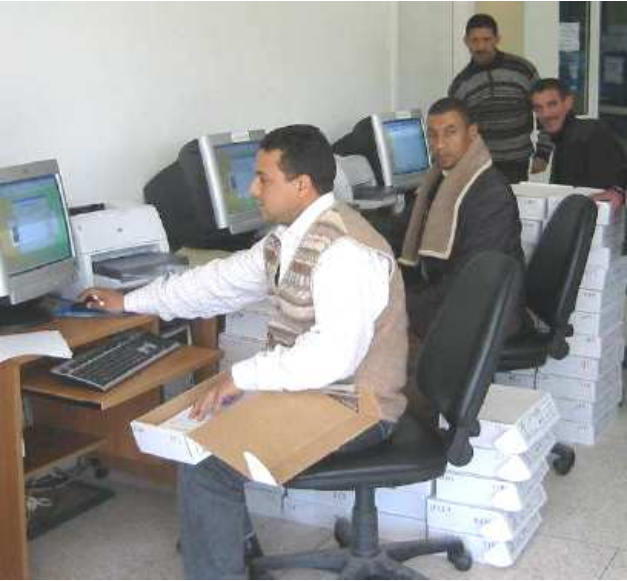
Reception of questionnaires

Receiving of questionnaires - The first step was to receive batches of questionnaires with an electronic file that indicated the identification number of each batch. Each batch of forms contained about 180 questionnaires from a statistical area. The number of received batches as well as any other nonquestionnaire content was verified against the delivery sheet. The identification number was entered into the computer system and a sheet was produced with a unique barcode on and placed on top of the batch in a box.