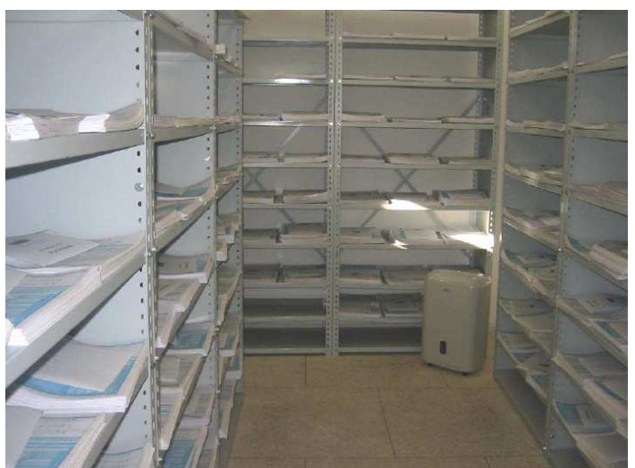
Controlled temperature storage area

2. Questionnaires preparation – Questionnaires were initially stored in a controlled temperature area to reduce their humidity content. Questionnaires that composed of many pages were then cut into individual pages for easy scanning.