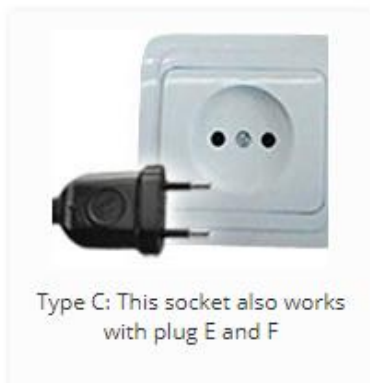
Type C: This socket also works with plug E and F