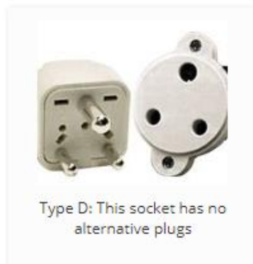
Type D: This socket has no alternative plugs