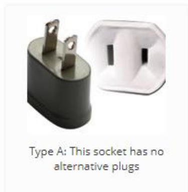
Type A: This socket has no alternative plugs