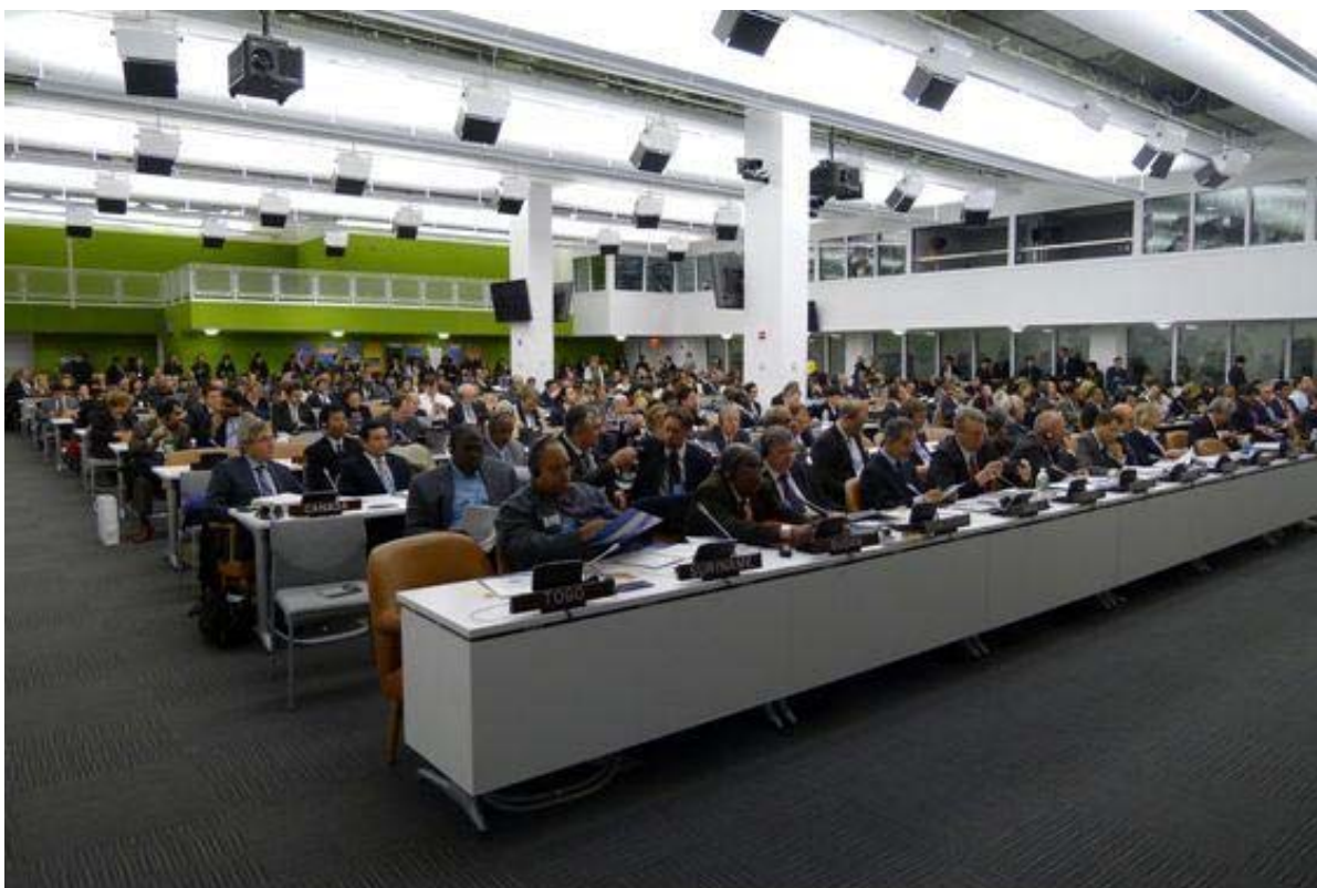
42nd session of the United Nations Statistical Commission, 22-25 February 2011

For more information on upcoming UNSD events, see http://unstats.un.org/unsd/census2010.htm