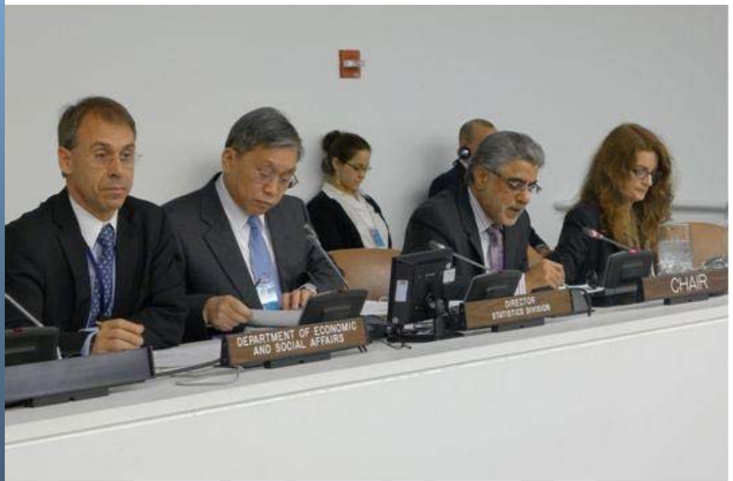
42 nd session of the United Nations Statistical Commission, 22-25 February 2011

The report also contains information on future activities related to the 2010 World Programme. In view of the fact that the vast majority of countries will have undertaken their 2010 round census by the end of 2011, the future UNSD work