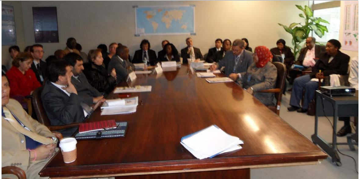
Learning Center on Census Data Dissemination