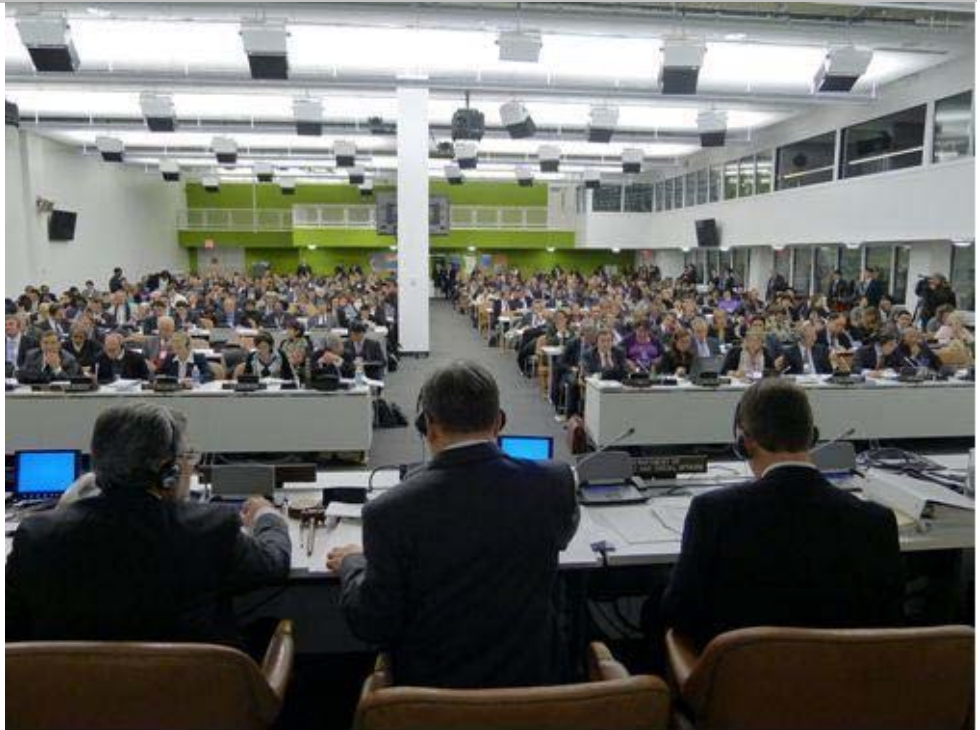
42nd session of the United Nations Statistical Commission, 22-25 February

For more information on the 2010 World Programme on Population and Housing Censuses see: http://unstats.un.org/unsd/census2010.htm