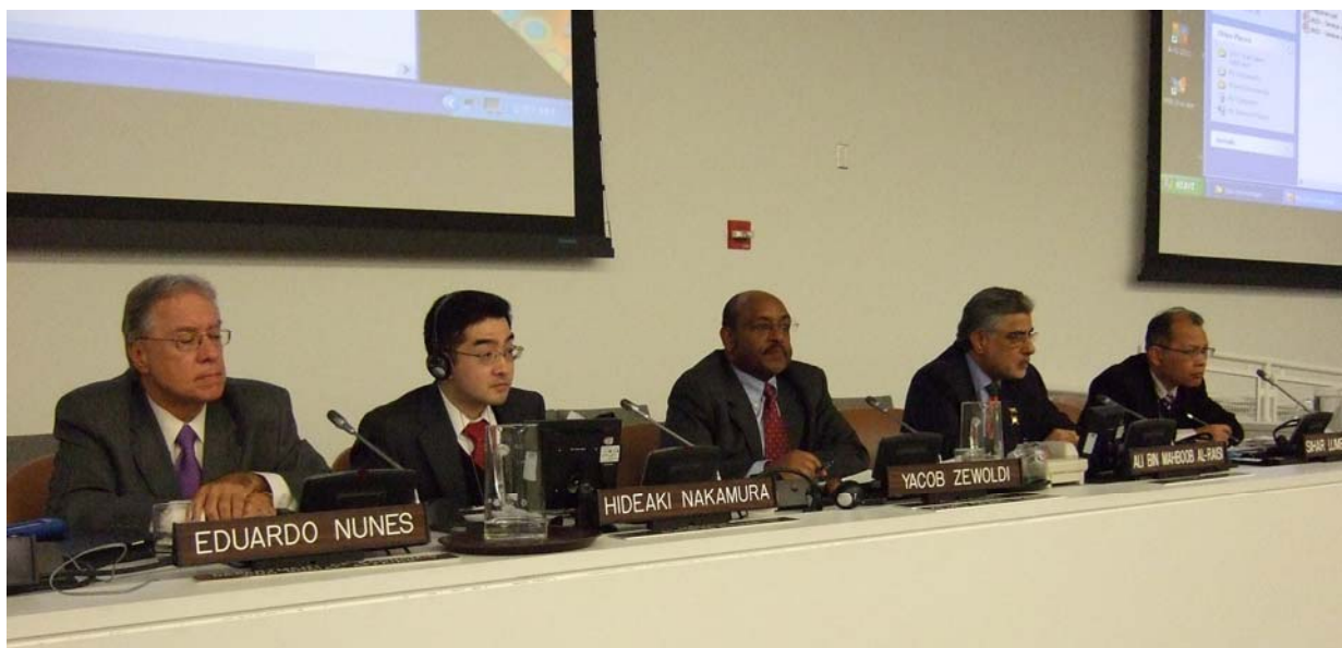
Seminar on New Technologies in Population and Housing Censuses

More information on the side event including the presentations is available at: http://unstats.un.org/unsd/statcom/statcom_2011/Seminars/NewTechnologies/default.html