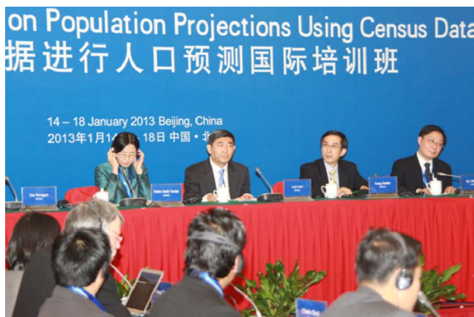
International Workshop on Population Projections using Census Data Beijing, 14-16 January 2013

More information on the workshop, including all of the presentations and exercises, is available on the UNSD website: http://unstats.un.org/unsd/demographic/sources/cwp2010/docs.htm