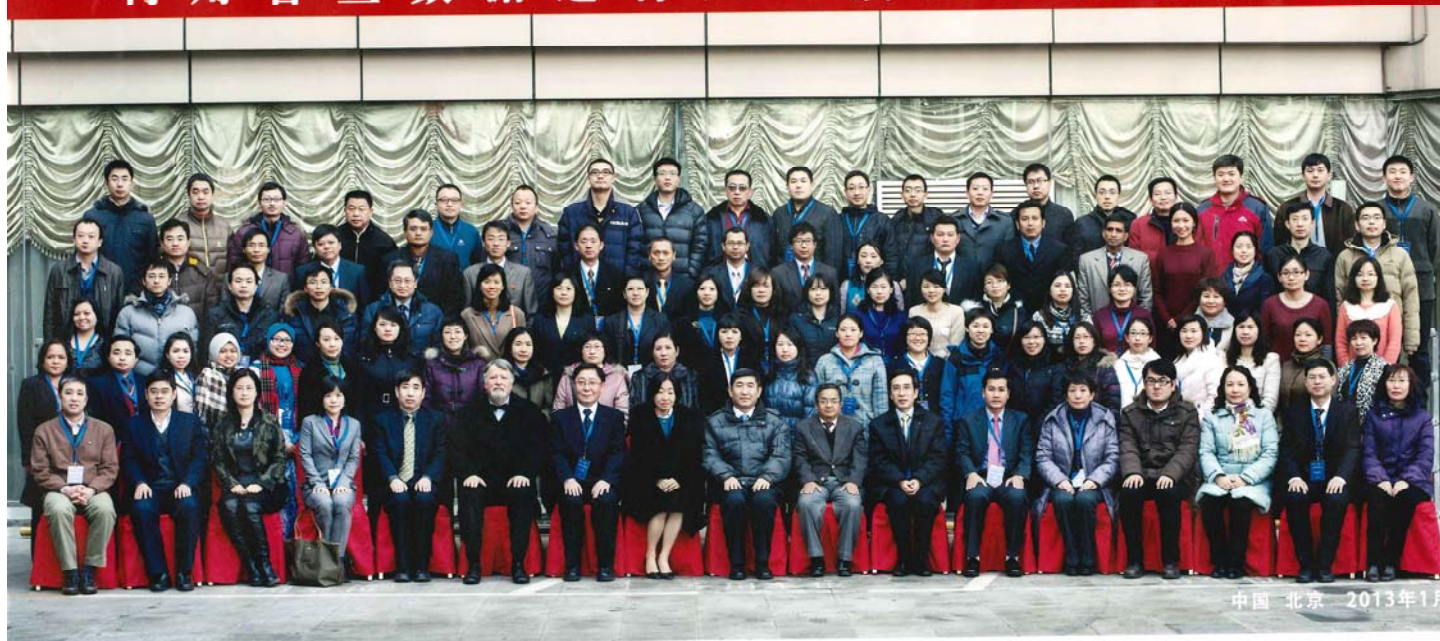
International Workshop on Population Projections using Census Data Beijing, 14-16 January 2013