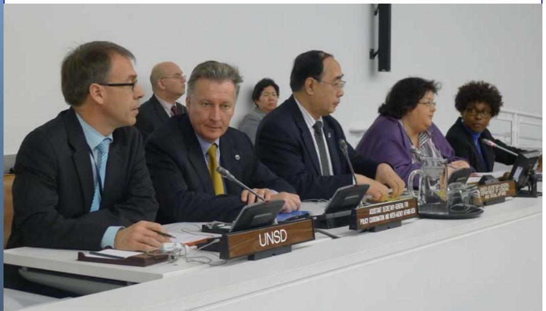
44th Session of the United Nations Statistical Commission, 26 February-1 March 2013

The report also introduces the work of UNSD on the revision of the Principles and Recommendations for a Vital Statistics System, outlining the major features and