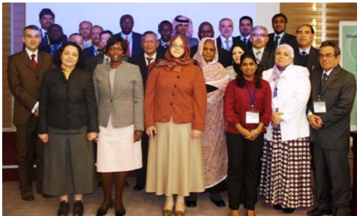
Seminar on Population and Housing Census Practices of OIC Member Countries Ankara, 6-8 March 2013

The objective of the Seminar was to take stock of national practices in conducting census for the 2010 round. The Seminar also provided an opportunity to discuss the future of population and housing censuses in the Organisation of Islamic Cooperation (OIC) member countries in terms of likely innovations in census methodology, use of modern technology and possible areas of cooperation in order to strengthen their national capacities in implementing population and housing censuses.