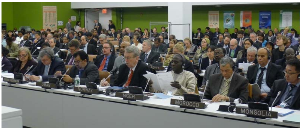
44th Session of the United Nations Statistical Commission, 26 February-1 March 2013

CensusInfo is a software package developed by the United Nations Statistics Division in partnership with UNICEF and UNFPA to help countries disseminate their census data on CD-ROM and on the web. It was officially launched at the United Nations Statistical Commission on 23 February 2009 and is distributed royalty-free. More information on CensusInfo is available at the website dedicated to its promotion: http://www.censusinfo.net