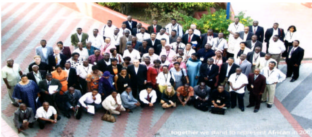
Participants at the 3rd Africa Symposium on Statistical Development

“A regional effort is therefore underway to increase the participation of African countries in the 2010 round of population and housing cen-