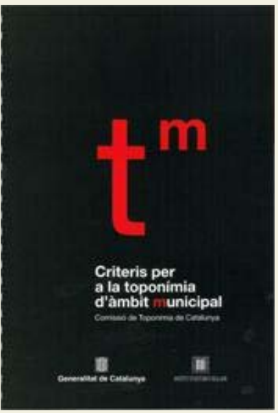
Contains the procedures for establishing and creating names of municipalities, neighbourhoods, streets, public services.