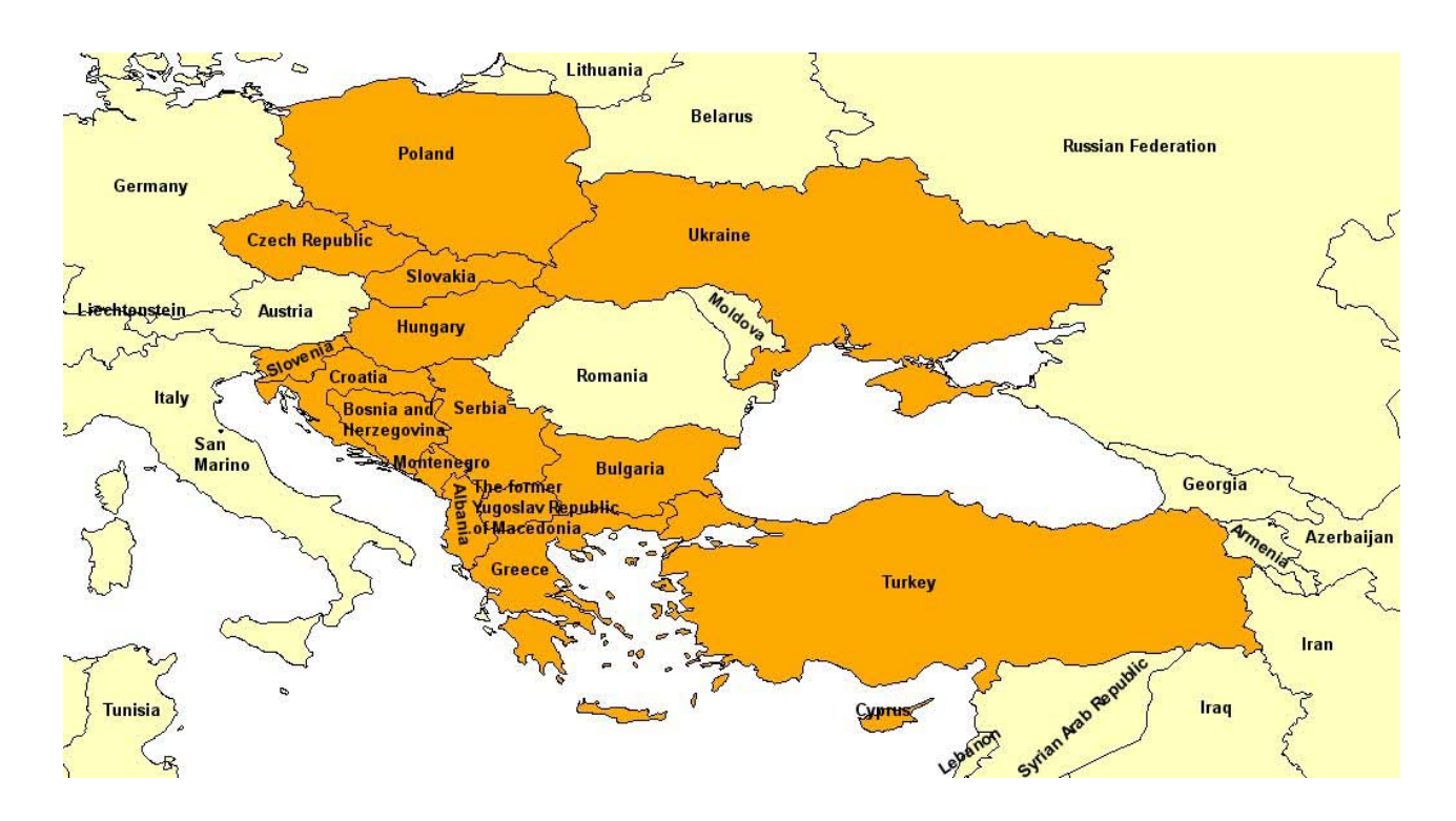
Figure 1: East Central and South-East Europe Division of UNGEGN

The East Central and South-East Europe Division currently has 15 countries identifying their participation: Albania, Bosnia and Herzegovina, Bulgaria, Croatia, Cyprus, Czech Republic, Greece, Hungary, Poland, Serbia, Slovakia, Slovenia, The former Yugoslav Republic of Macedonia, Turkey and Ukraine (refer to Figure 1). In progress is the introduction of Montenegro as a new Division country.