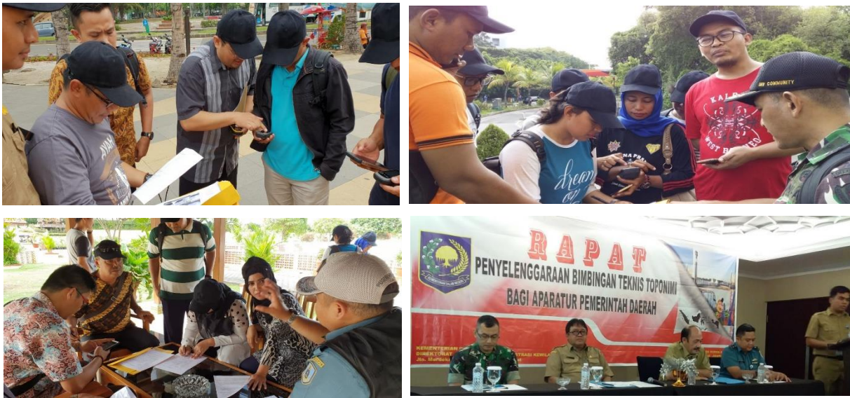
Figure 2 Toponym activities of the Ministry of Home Affairs shows verification and standardization of geographical names and Toponym Technical Guidance meeting

Toponym technical guidance had also been carried out for local government officials from several provinces during the period of September – October 2018.