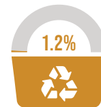
LATIN AMERICA AND THE CARIBBEAN