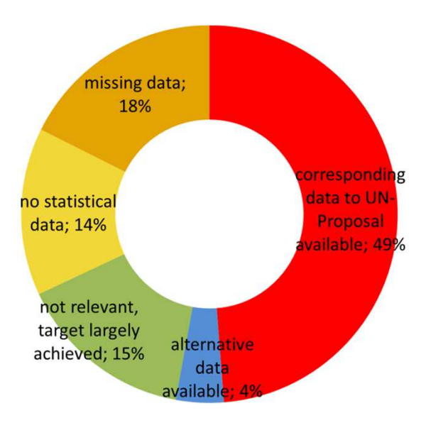
Q: Statistics Austria, October 2019. Availability according to UN indicator proposals.