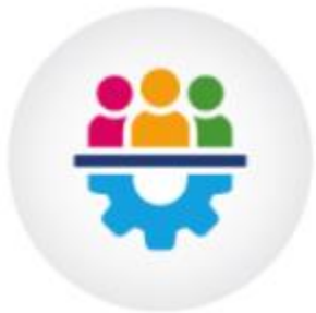
Teams of experts