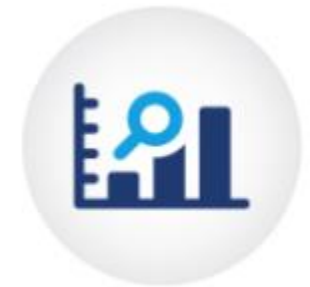
Progress in the region