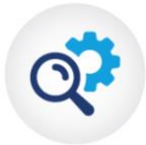
Guidelines and tools