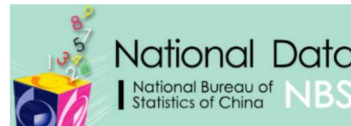
Statistical Online Database