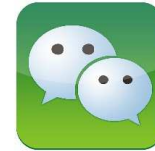
WeChat Official Account