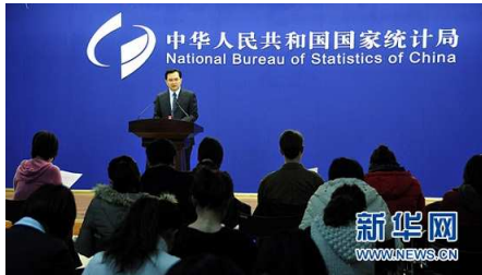
News Release Conference