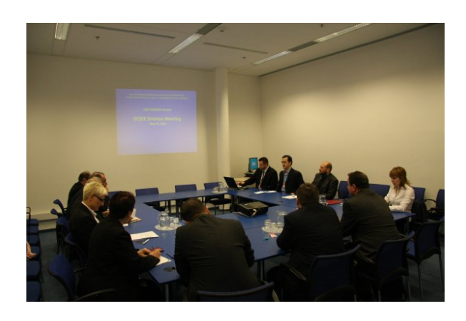
Figure 1a: ECSEED meeting

The East Central and South-East Europe Division (ECSEED) organized a meeting during the 26<sup>th</sup> UNGEGN Session (2 - 6 May 2011, UN Center Vienna). The ECSEED meeting was held on the 4th May in the UN Center Vienna. The meeting was attended by 14 representatives: Croatia (1), Cyprus (2), Georgia (3), Greece (1), Poland (3), Slovenia (1), the former Yugoslav Republic of Macedonia (1) and Turkey (2) (see Fig. 1). The last 20th ECSEED Session was held a few months before, in February 2011 in Zagreb. But, during that period there were important Division activities.