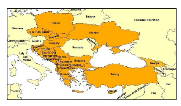
Figure 2: ECSEE Division countries

Georgia joined ECSEED (see Fig. 2). Before that, Montenegro was accepted into the ECSEED in 2008 during the 19th ECSEED session in Zagreb. The ECSEE Division has now 17 countries active (see Table 1).