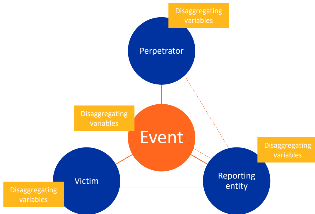
Figure 1. The framework of the IC-TIP