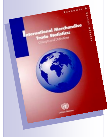
(unstats.un.org/ unsd/pubs/ gesgrid.asp?id=111)

IMTS "Concepts and Definitions" Manual is available online in six languages: