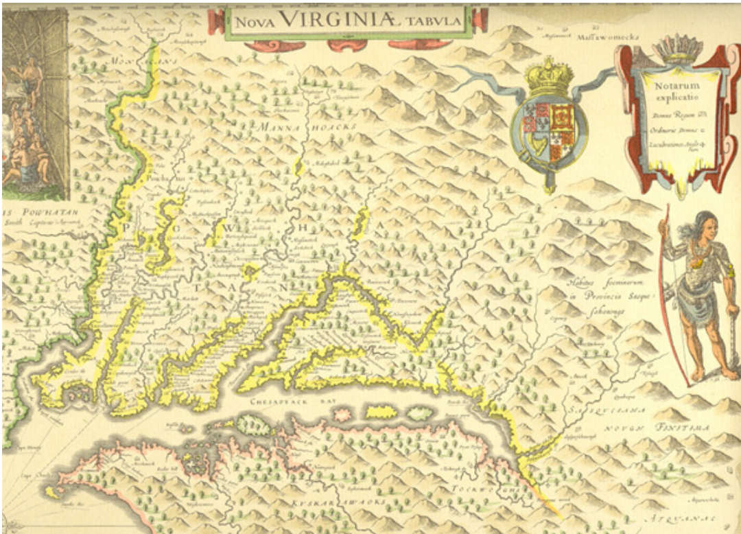
Map of Virginia by John Smith

The only Indian names still visible on nowadays maps are hydronyms (see underlined names below)