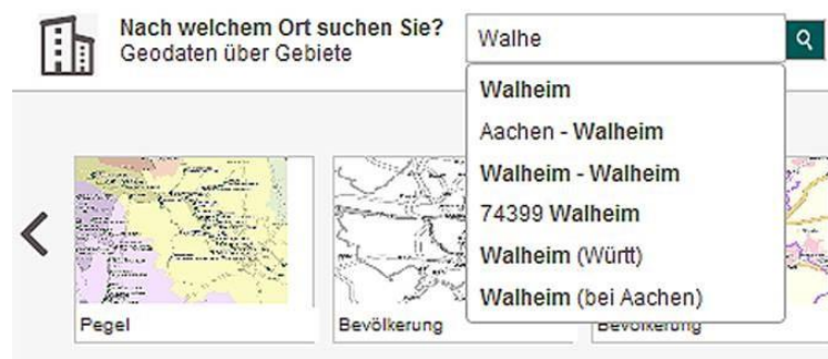
Figure 4 - The search utility within the Geoportal.DE – live suggest during user input

The ‘Georeferenced Address Data Federation’ dataset mainly consists of data from the ‘Association for the Distribution of House Coordinates’ run by the surveying authorities of the Länder. After processing, this dataset provides point coordinates for house addresses and encircling bounding boxes of streets, places and zip codes. The search utility implements two search strategies: a high performance live suggest search, i.e. to deliver real time suggestions for search terms and/or other relevant information based on live user input in an application, on the one hand, and a fault-tolerant search on the other. Words matching the search term are highlighted. While in the results of the live suggest search only the elements of the objects’ name as part of the address are shown, the fault-tolerant search provides the complete dataset including geometry. If the match between search term(s) and results is weak, a list of similar places or addresses is offered. The search utility is able to handle unstructured input of addresses.