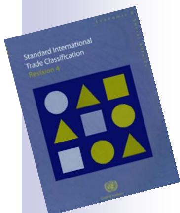
The Standard International Trade Classification, Rev. 4 is available online at unstats.un.org/unsd/cr/registry/