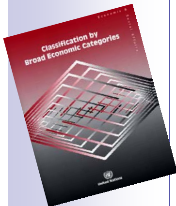
The 4th revision of the Classification by Broad Economic Categories was released in July 2003