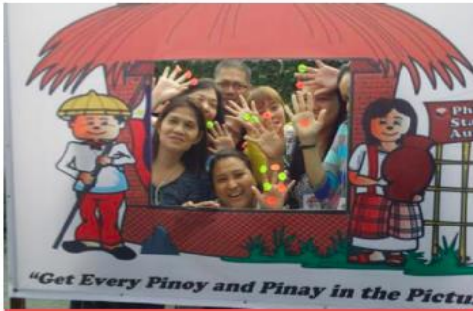
Get Every Pinay and Pinoy in the Picture