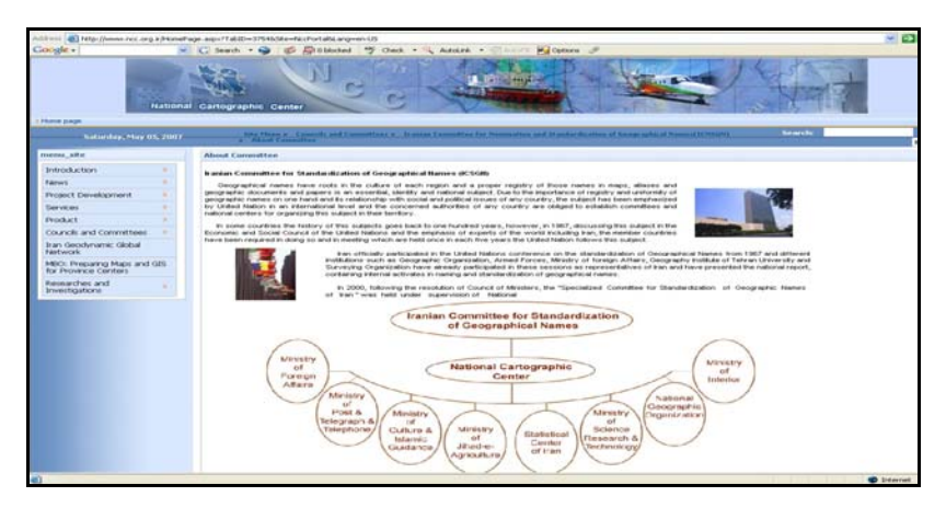
Figure 3. A Website page of Iranian Committee on Naming and Standardization of Geographical Names

The website address is: <a href="http://geonames.ncc.org.ir">http://geonames.ncc.org.ir</a>