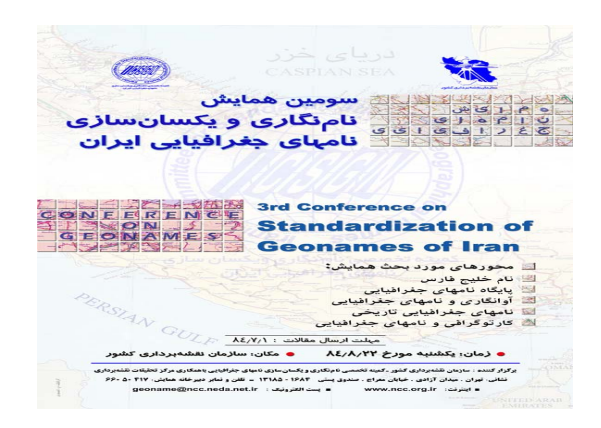
Figure 4. Poster of 3<sup>rd</sup> meeting on standardization of geographical names

A regional meeting on standardization of geographical names was held on 21 - 22 November 2003 in Tehran at National Cartography Center by the presence of representatives from Cyprus, Afghanistan, Pakistan, Turkey and Azerbaijan. A comprehensive report of the