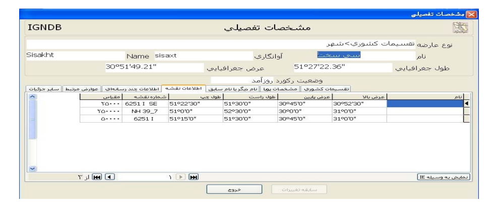
Figure 2. Perspective of searching result of a name in Iranian geographical names database

It is worthy to note that, for the time being, about 70000 geographical names and their related characteristics have been entered into the database, and the search of which is possible in different ways at the same time.