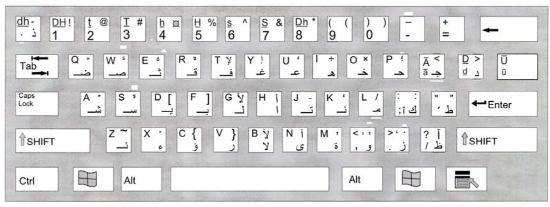
a' = Alt + 1 A' = Alt + 2