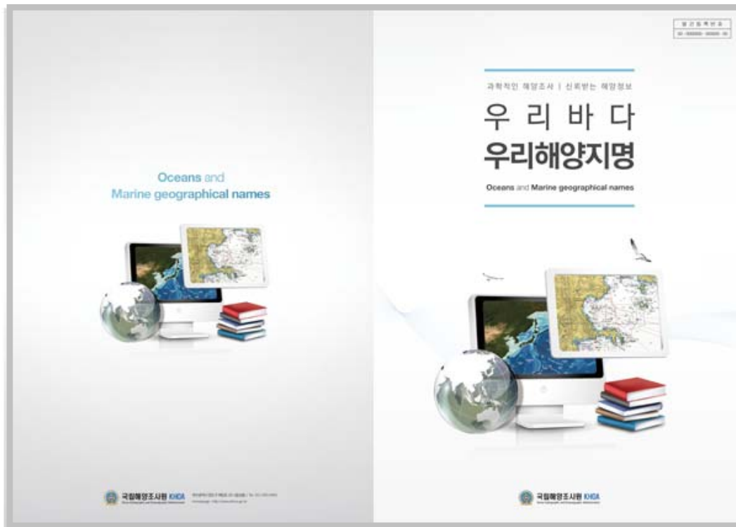
Figure 1. Cover Page of Collection of Marine Geographical Names

The first part of this book explains about the importance of marine geographical names, the procedures related to the standardization of marine geographical names, definitions of various generic terms, registration and notification. It then provides an index map by region and lists both the marine surface names and undersea feature names by region. This book has been designed to help the readers better understand the marine geographical names (Figure 1 - 3).