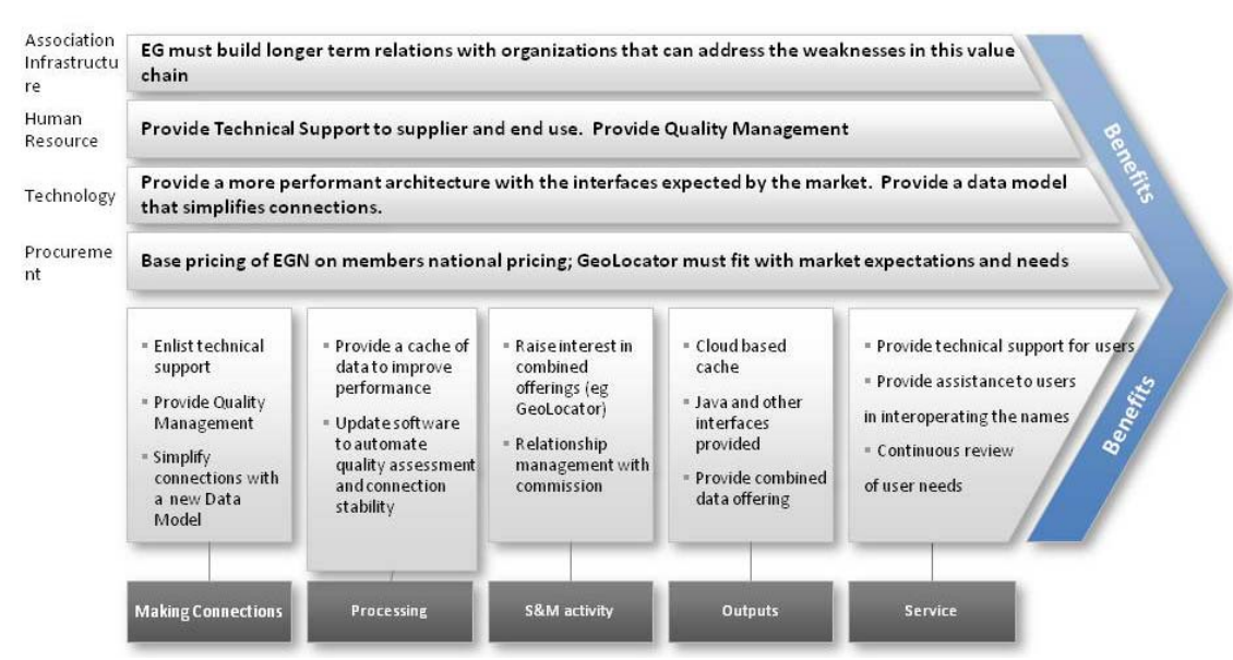
Figure 2: A value chain analysis describes the improvements needed to make EGN a viable and sustainable service

EuroGeoNames continues to be supported and extended by EuroGeographics together with the German Federal Agency for Cartography and Geodesy (BKG) and the Finnish Geodetic Institute (FGI).